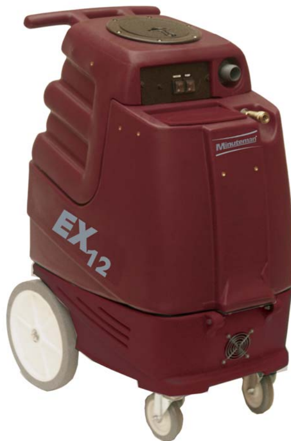
EX12 & EX12H Portable Carpet Extractors