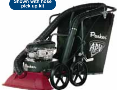
APV Litter Vac

All Purpose Vacuum Cleaning Path: 30" 10 cu. ft. bag capacity #LV02675B