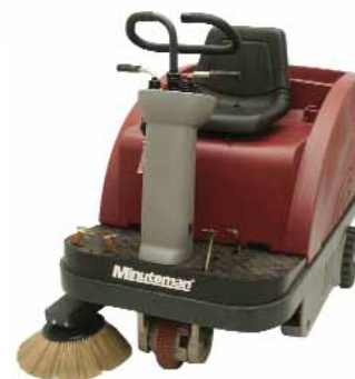
Kleen Sweep® 40R

Type: Walk Behind Sweeping Path: 35" Coverage sq. ft./hour: 55,440 Product Code: #HM350000QP