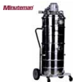
Explosion & Dust Ignition Proof

Capacity: 15 gal., dry 99.97% efficient @ 0.3 microns #C82915-05