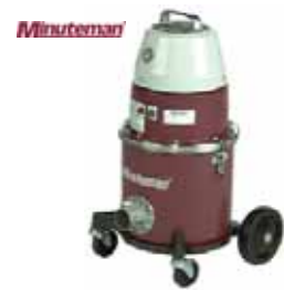
CRV™ Clean Room

Capacity: 55 gal. Wet pick up only #C87355-01