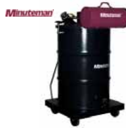
Flammable Liquid Recovery

Capacity: 6 & 15 gal. Dry pick up only U.L.P.A. Filter 99.9999 % efficient @ 0.12 microns #C82907-00 6 gal. #C82917-00 15 gal.