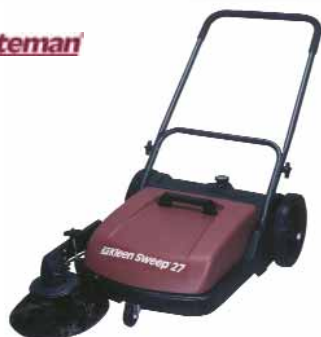
Kleen Sweep® 27

Type: Walk Behind Sweeping Path: 27" Coverage sq. ft./hour: 31,000 Product Code: #C89000-00