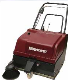
Kleen Sweep® 35W

Type: Walk Behind Sweeping Path: 27" Coverage sq. ft./hour: 31,000 Product Code: #C89000-00