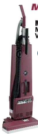
MPV® 14 Multi-Purpose Vacuum

Bagged container Cleaning Path: 12" 6.5 amp motor #SC785