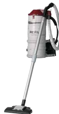
BPVBack Pack Vacuum

Sweeping Path: 14" Top fill design - 4 level filtration Includes tool, wand and hose assembly #C47185-00