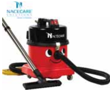
NVQ380 (Quiet Vac)

Capacity: 4.5 gal. dry only Low 47/49 dB(A) for sensitive areas Structural foam tank #NVQ380