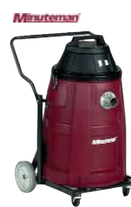
Tip 'N Pour

12 gallon 2 - 1,200 W, 1.6 Hp Unique tip & pour system #WVD 902