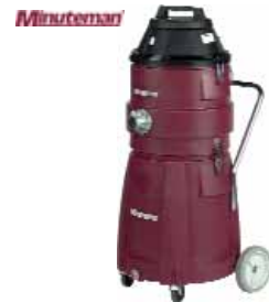
X829-15 HEPA Vac

Capacity: 4 gal. H.E.P.A. Type filter 99% efficient @ 0.3 microns #C82904-04