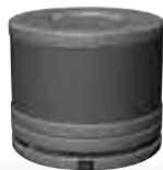
SA50 Roomaid For small offices or rooms up to 200 sq. ft.