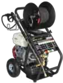
Cold Water • Heavy Duty Industrial • Gas