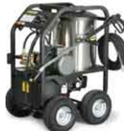
Hot Water • Gas