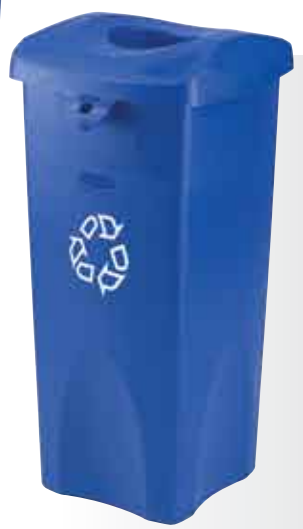
3569-88 Base with 2691 Bottle/Can Top • Untouchable Square Recycling Container