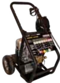
Cold Water • Heavy Duty Gas