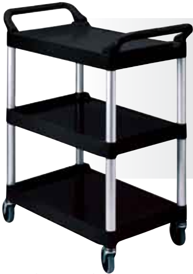
3424 • Utility Cart with 4" Swivel Casters