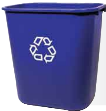
2956 • Deskside Recycling Container 28qt.