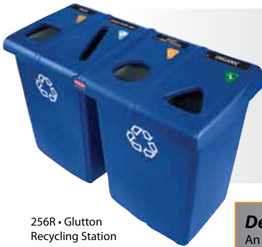
256R • Glutton Recycling Station