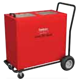
SA7000 For renovations, mould, lead or asbestos removal in areas up to 5000 Sq. ft.

For more information visit us at: www.swishclean.com