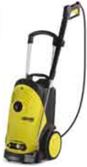
Cold Water • Electric