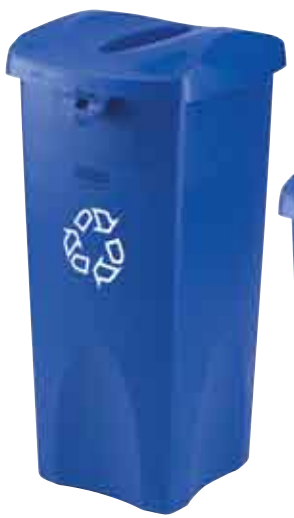
3569-88 Base with 2690 paper Top • Untouchable Square Recycling Container