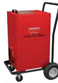
SA6000 For renovations, mould, lead or asbestos removal in areas up to 4000 Sq. ft.