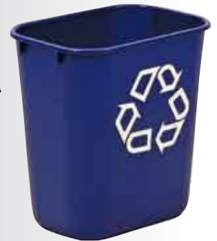
2955 • Deskside Recycling Container 13qt.