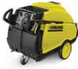
Hot Water • Electric