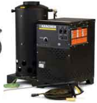
Hot Water • Stationary • Natural Gas

BE SAFE • BE SURE • Indoor Air Quality is Important