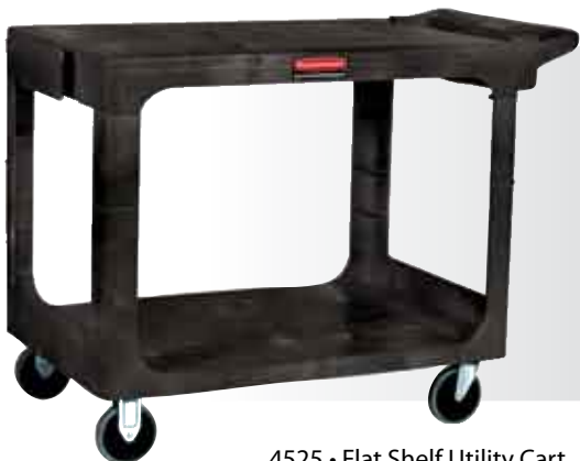
4525 • Flat Shelf Utility Cart