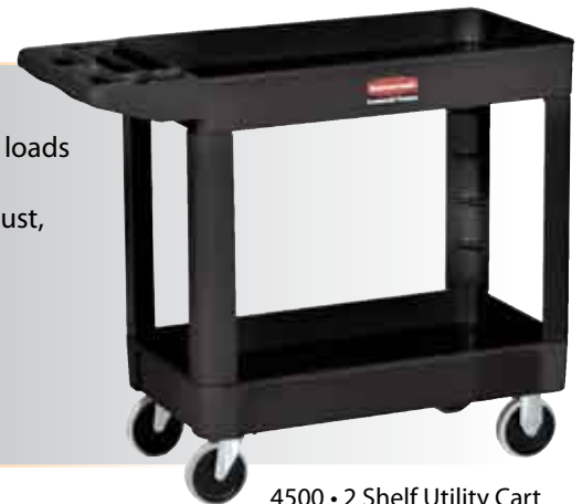
4500 • 2 Shelf Utility Cart