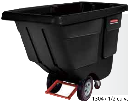
1304 • 1/2 cu yard 1314 • 1 cu yard