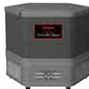
SA2500 For larger offices or rooms up to 800 Sq. ft.