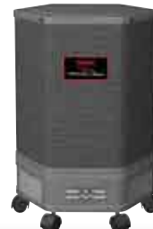
SA5000 For larger spaces or health facilities up to 1400 Sq. ft.