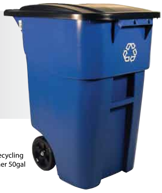
9W27 • Brute Recycling Rollout Container 50gal